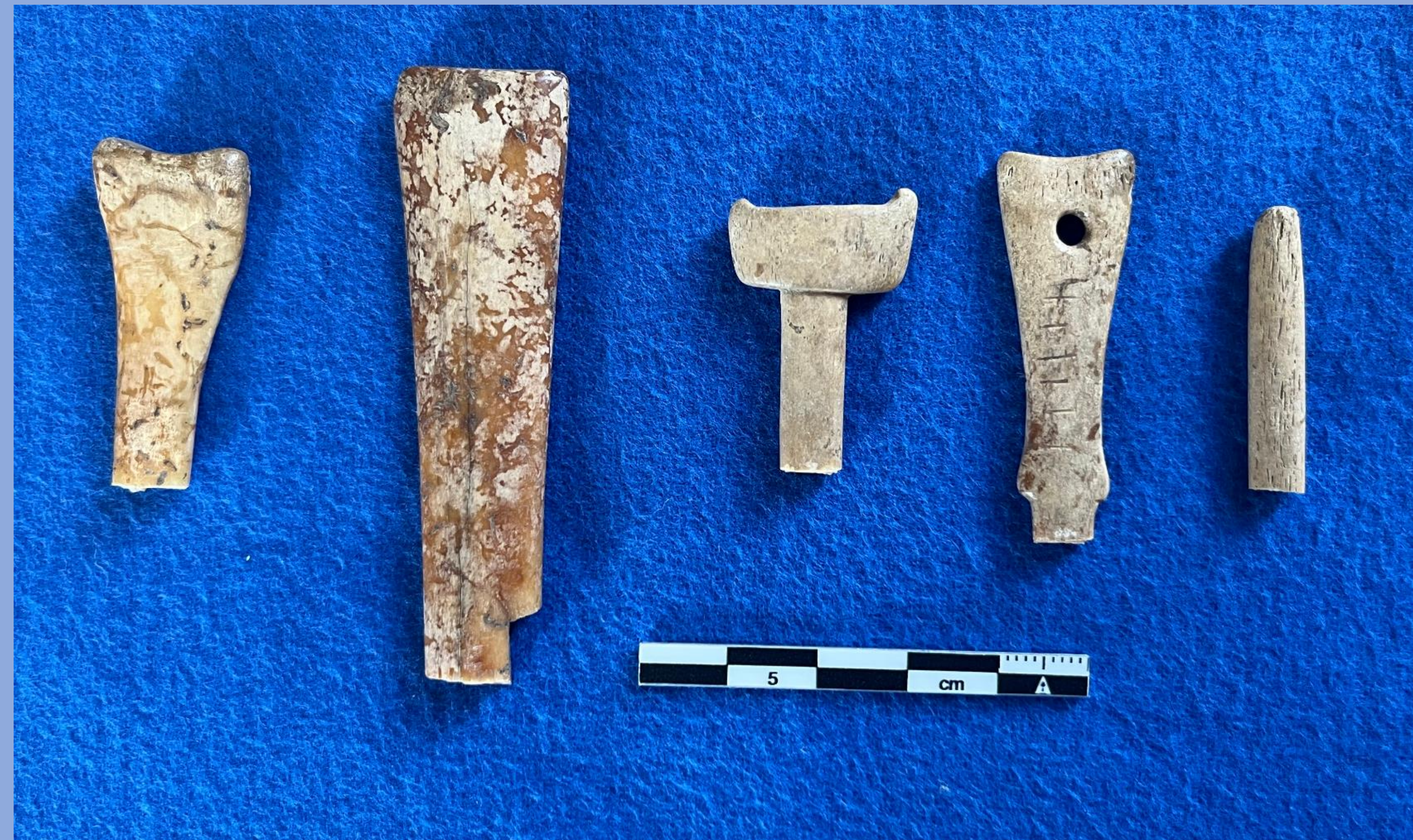
Five bone pins that were radiocarbon dated: Left to right: T-top type 1, Square top, Crutch top, Double expanded, Blunt top