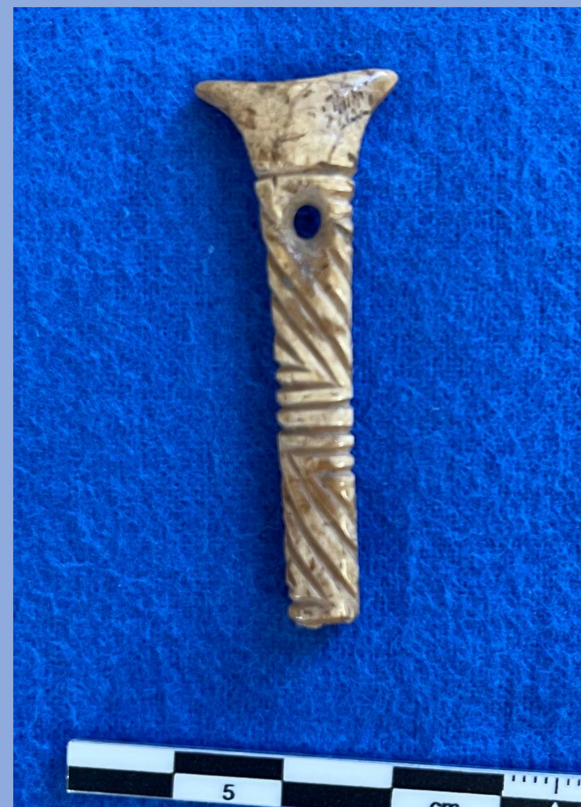
T-top, type 2 with concentric zig-zag design